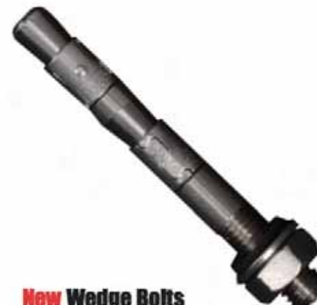
New Wedge Bolts Available in 3/8"